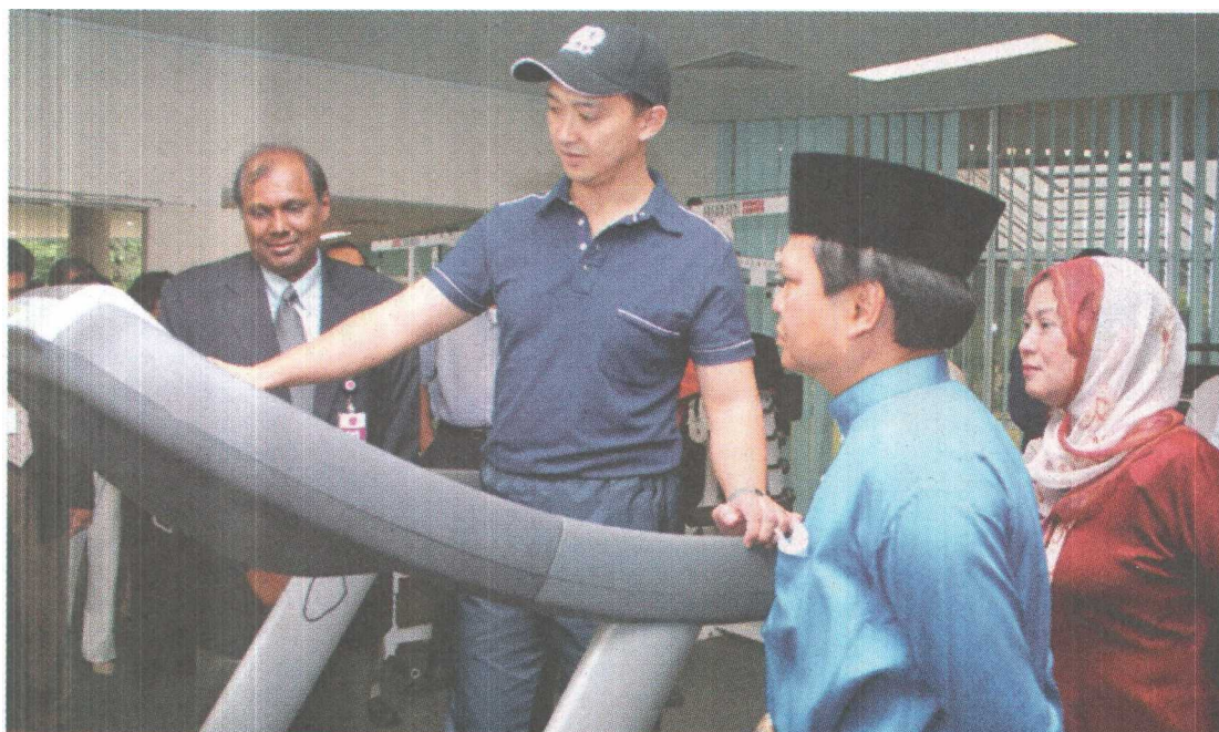
A Mimos gym instructor demonstrating how to exercise with a treadmill.