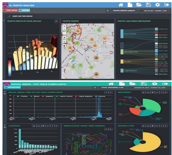
MIMOS Mi-Flash dashboard screens