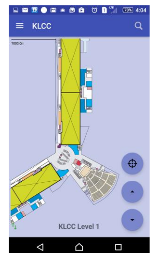
MIMOS Mi-Tuju indoor location and navigation (mobile app)