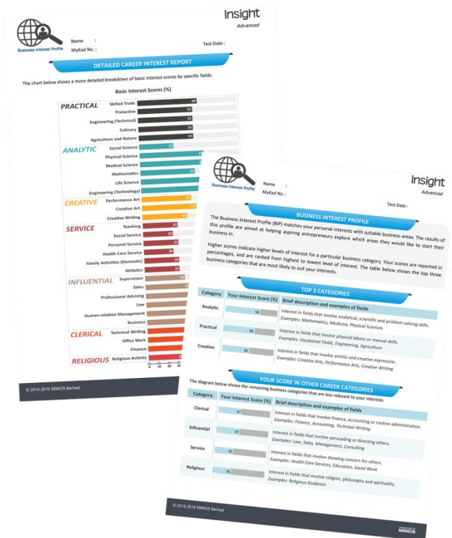
Sample Business Interest Profile Insight

Psychometrics Cluster MIMOS Berhad Technology Park Malaysia 57000 Kuala Lumpur Malaysia E-mail: psychometrics@mimos.my Tel: (603) 8995 5173 Fax: (603) 8991 4238