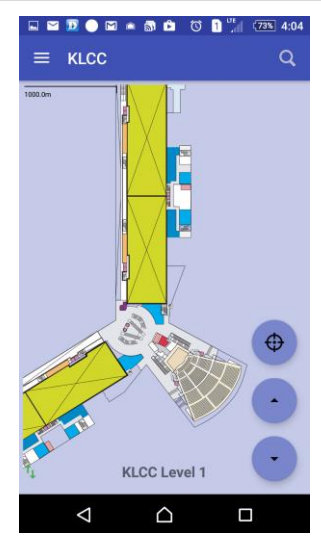
MIMOS Mi-Tuju indoor location and navigation (mobile app)