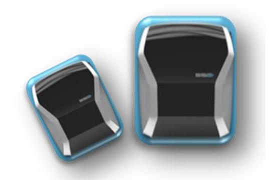
Mi-SSEC prototype system

Disclaimer: Trademarks, logos and images of third parties used are the property of the respective owners. They are used for illustration purposes only.