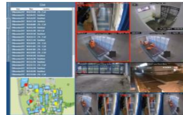
Comprehensive and integrated viewer